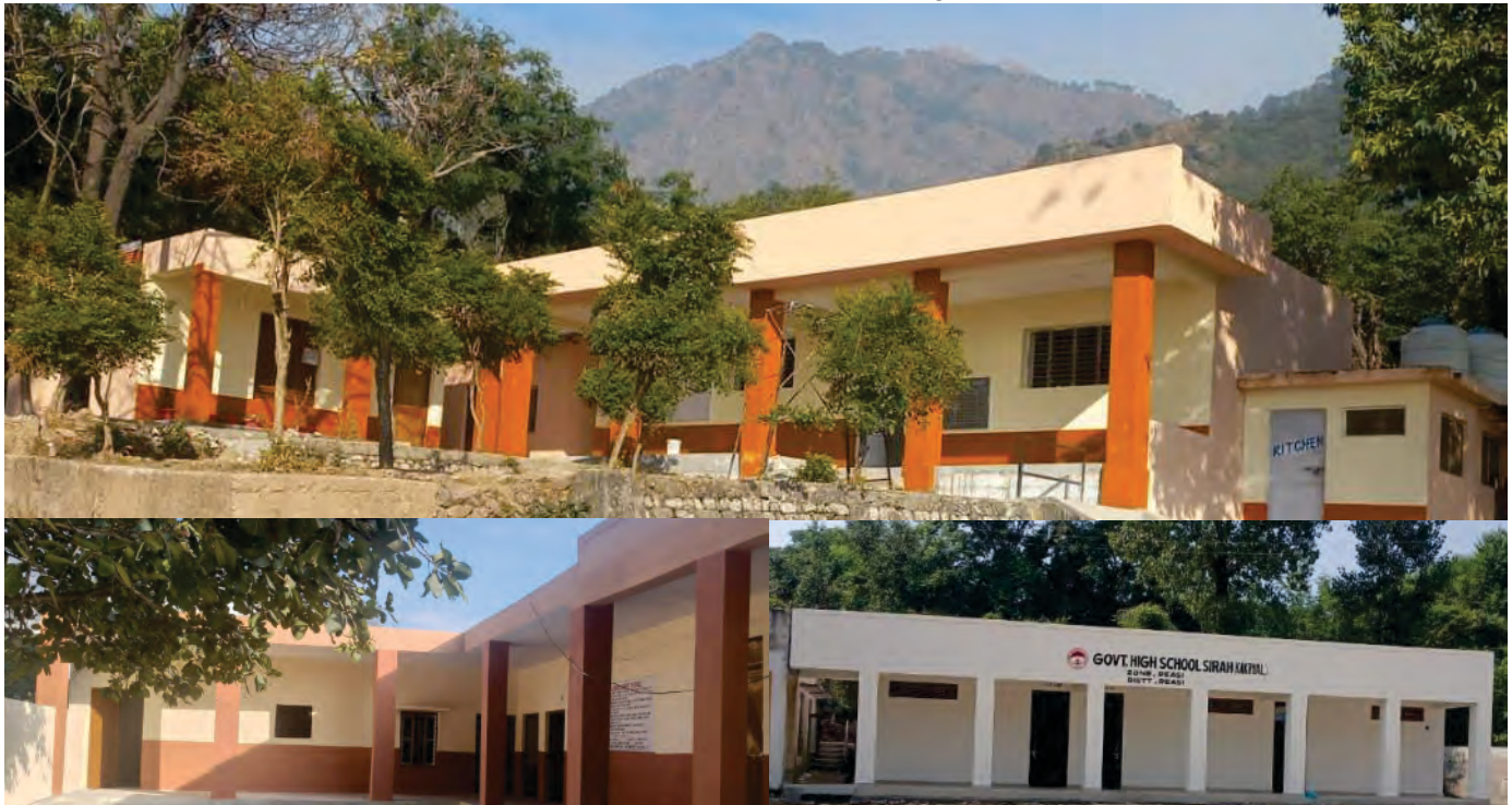
Renovation of School building under Social Support Initiatives

As a part of this project of crucial importance, The Board undertook a range of sub-activities including repair of damaged roofs, waterproofing, plastering and painting of classrooms, strengthening of structures, repair of doors and windows, improvement of sanitation units, electrification and flooring works as necessitated. Special emphasis was laid on safety, hygiene and the creation of child-friendly