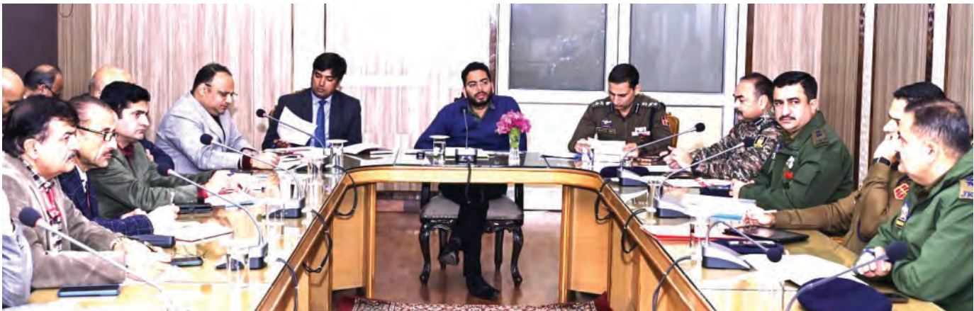
CEO, Shrine Board reviewed Yatra preparedness Ahead of New Year

The meeting concluded with consensus on seamless coordination, heightened vigilance and ensuring a safe and spiritually enriching pilgrimage experience for devotees during the New Year period.