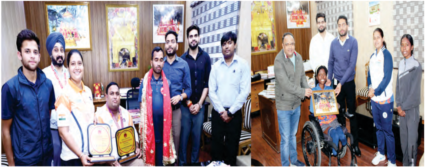
SMVDSB Honors Participants of Para Archery World Championship