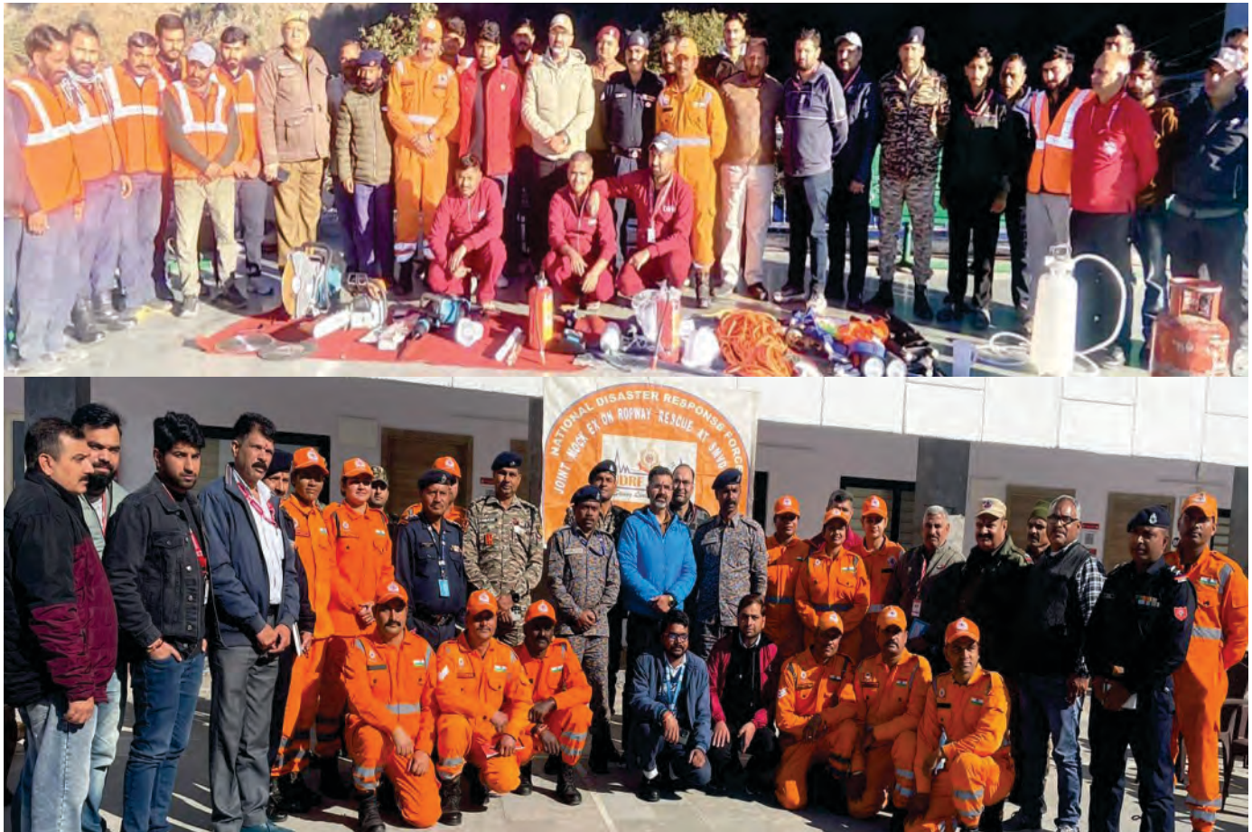
SMVDSB Organizes Fire Safety Awareness Drive and Mock Drills at all Sectors of Shrine Board

The activities of critical importance were supervised by the respective Area Heads to ensure seamless coordination. The Shrine Board continues to conduct such exercises at regular intervals as part of its comprehensive safety management framework, aimed at ensuring that all personnel remain duly trained, alert, and prepared at all points in time to respond effectively during emergencies. These initiatives reinforced the Board's commitment to providing a safe and seamless pilgrimage experience for devotees and help in capacity building.