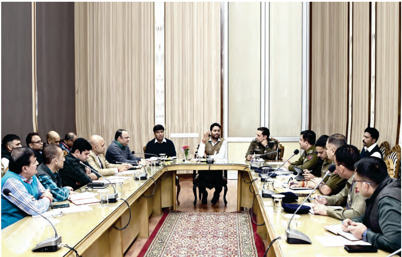
CEO SMVDSB chair review meeting on disaster preparedness and security measures for the Yatra

The CEO highlighted the central role of the Integrated Command and Control Centre for real-time monitoring and coordination. Security agencies were directed to review the functionality of all security equipment and procure critical items immediately, along with deploying additional personnel to strengthen security across the Shrine area.