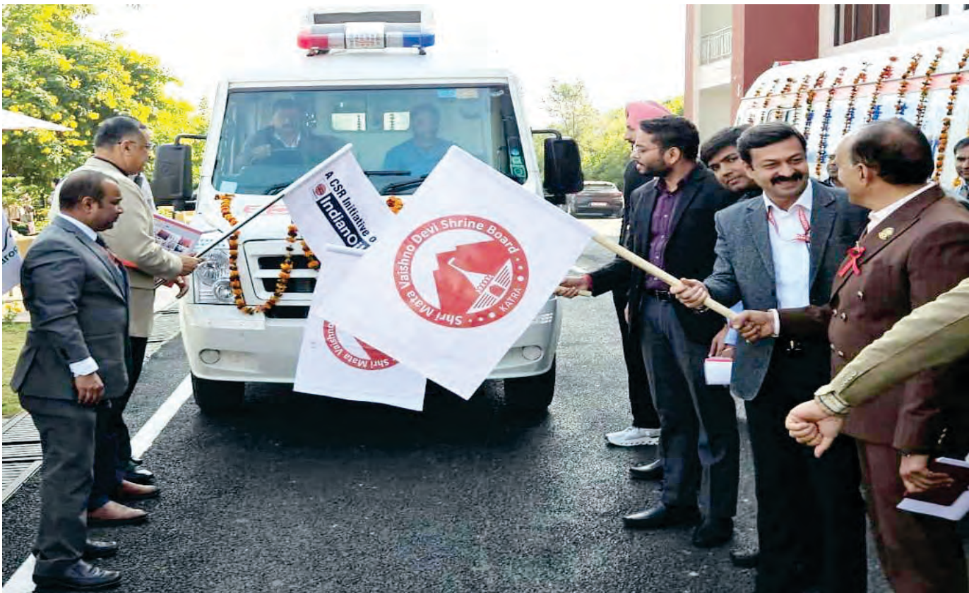
CEO SMVDSB flagged off Blood Donation Van and Critical Care Ambulance

The CEO expressed gratitude to IOCL for its generous CSR contribution, noting that the new ambulance and blood donation van had strengthened emergency response and blood collection services. He stated that the addition of Dialysis Unit and Hospital Beds had enhanced patient care and treatment capacity of SMVDNSH, while support for the Cochlear Implant Programme had proved life-changing for hearing-impaired beneficiaries. He further highlighted that specialized equipment including a Polygraph Machine, Ergograph Machine and advanced Physiology Laboratory systems had strengthened teaching and research facilities at SMVDIME, enriching medical education and clinical practices.