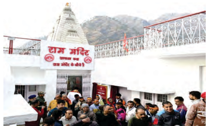
Inauguration of 'Sadhana Kaksh' for devotees at Bhawan

The creation of Sadhana Kaksh was a sequel to several pilgrim-centric initiatives undertaken by the Board recently such as new Yagyashala, expansion of the Atka area and