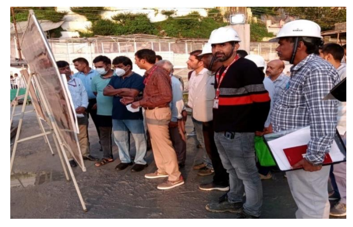
Chief Secretary reviews status of ongoing mega projects, facilities at Shri MataVaishno Devi Shrine

provide separate paths for incoming and outgoing pilgrims at Bhawan.