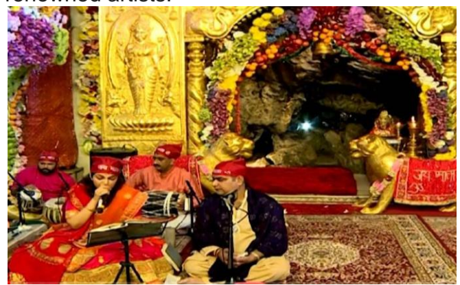
Renowned artist reciting Bhajans during Atka Aarti

Grand decorations were made at Shri Mata Vaishno Devi Bhawan, Atka and the area surrounding it with indigenous-foreign fruits and flowers, as well as huge reception doors and pandals were installed in the Bhawan Area. Likewise, the illumination of the Bhawan area with attractive and colorful lights has also been done. Also, as was done in last year's Shardiya Navratras, this year's other special features of arrangements included Bhajan and Bhaint performances during morning and evening Atka Aarti by the renowned artists.