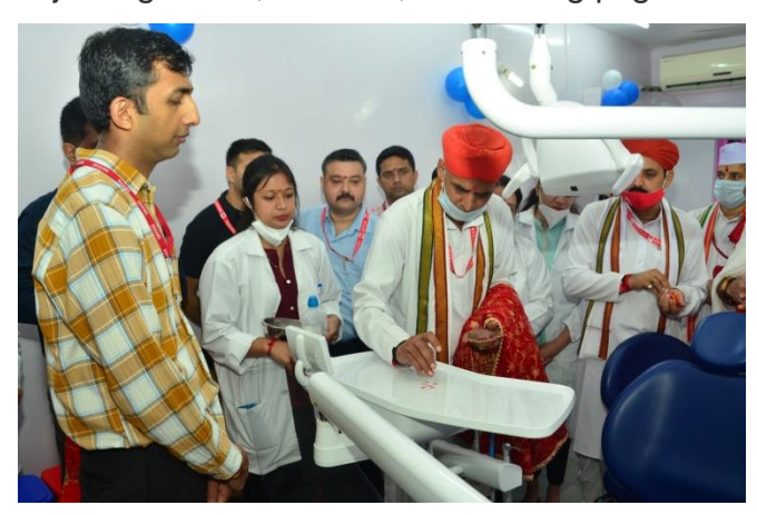
SMVDSB adds Satellite Dental Clinic to healthcare

benefit about 1200 employees and their families at large stationed at Sanjichatt and adjoining areas, besides, the visiting pilgrims.