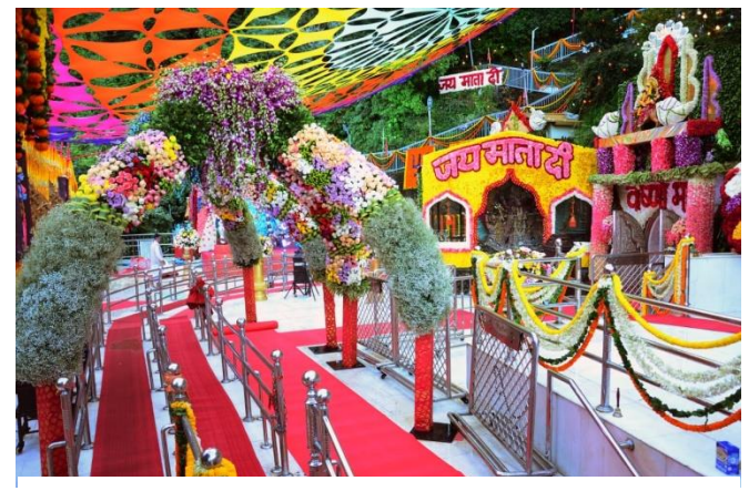
Decorations of Outer Cave at Bhawan

Noteworthy, RFID -based tracking and dispatching pilgrims in batches, a focused Shrine for initiative of Board Yatra Management to ensure their safety, comfort and ease of commutation has already been rolled out by the Shrine Board well before commencement of Navratra. In addition, erecting welcome gates, the Shrine Board unveiled special selfie-points for the first time en-route the Holy shrine for the pilgrims to capture fond memories of their visit during Navratra.