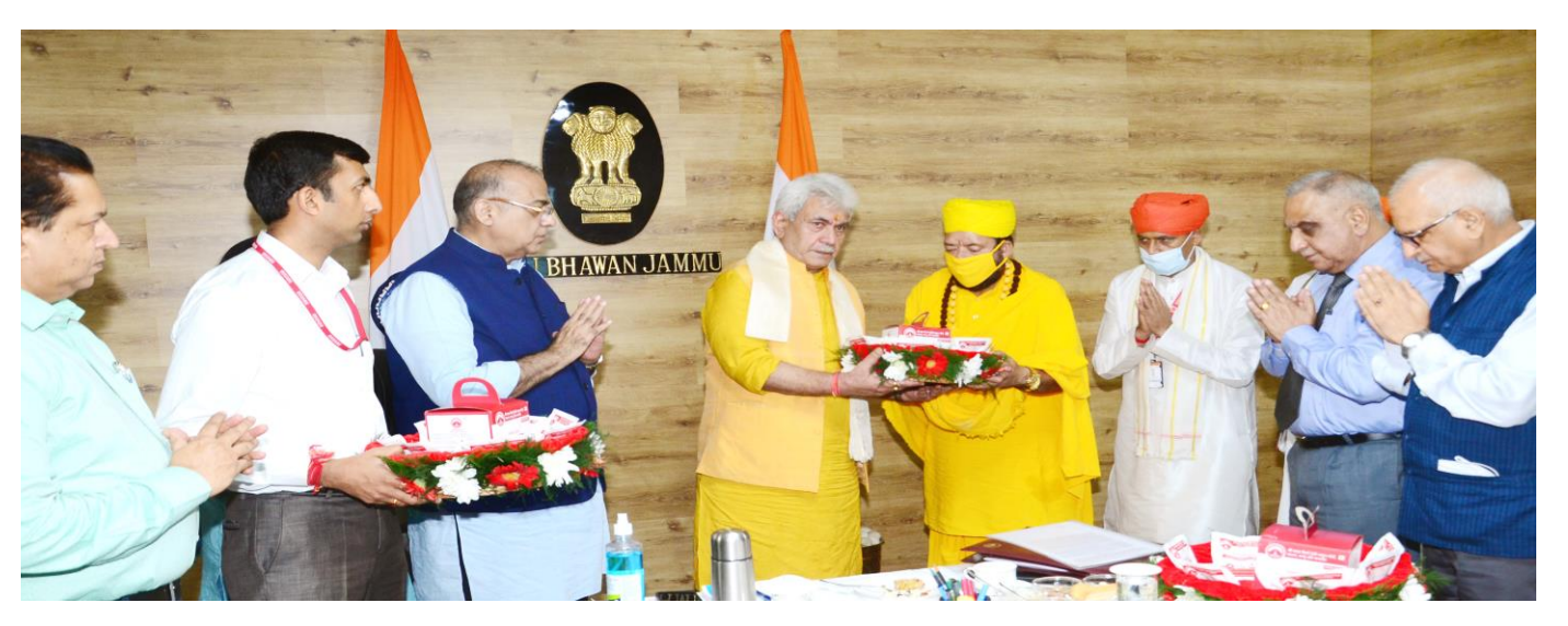
Lt Governor lays e-foundation of Sky Walk, Gayatri Bhavan & other infra projects of Shri Mata Vaishno Devi Shrine.

Conceptualized with an emphasis on safety and facility development, the Sky Walk which will be executed through CPWD with wooden flooring will be 20 feet above the track level, 200 meter in length with two rescue areas having provision of seating arrangements for senior citizens & ladies. In addition, two waiting halls with washroom facilities are being constructed along the Sky Walk to accommodate around 150 devotees.