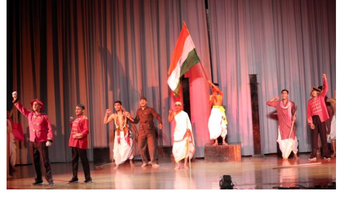
Students performing play on Annual Day

He also briefed the gathering on the efforts being made for continuing improvements in the functioning of Gurukul.