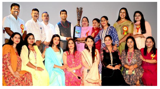
Nursing Fest 'Tarang' 2022 hosted by SMVDCoN concludes on a high note.

The 2 - days Inter College Nursing Fest Tarang '2022', organised by Shri Mata Vaishno Devi College of Nursina (SMVDCoN), Kakryal, concluded with the valedictory function held at the Spiritual Growth Centre here on 23rd September. After two years gap due to pandemic 'Nursing fest' has recommenced for the third time as per directions of Hon'ble Chairman, SMVDSB (Hon'ble Lieutenant Governor, JK-UT) who called that success as a nation can only be achieved by promoting a culture of ideas and innovation with dedication, discipline and determination".