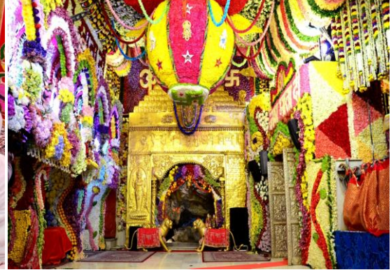
Grand decorations of Atka area during Navratra at Shri Mata Vaishno Devi Shrine

On this festive occasion, as per the directions of Hon'ble Chairman (Hon'ble Lt. Governor, JK-UT), Shrine Board provided free pony and battery car services to 'Divyang' devotees with special arrangements for their priority darshans at sanctum sanctorum by setting up of help desks for their convenience at various locations.