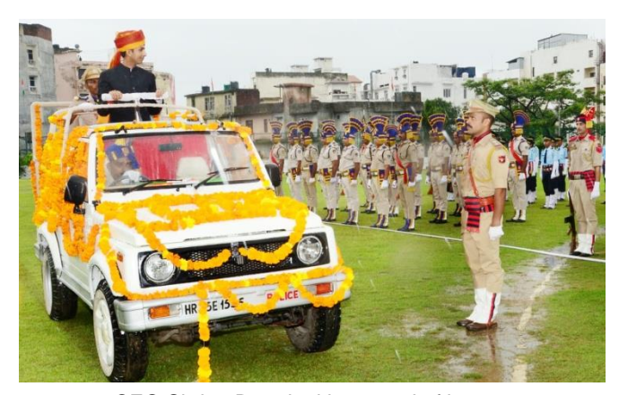
CEO Shrine Board taking guard of honour

objective, plantation of Trikuta Hills has been undertaken on a very large scale by planting 1.25 lakh saplings, besides, rejuvenation of Banganga rivulet.