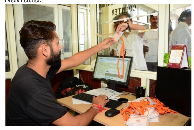
Registration of Yatra through RFID

Noteworthy, RFID -based tracking and dispatching pilgrims in batches, a focused Shrine for initiative of Board Yatra Management to ensure their safety, comfort and ease of commutation has already been rolled out by the Shrine Board well before commencement of Navratra. In addition, erecting welcome gates, the Shrine Board unveiled special selfie-points for the first time en-route the Holy shrine for the pilgrims to capture fond memories of their visit during Navratra.