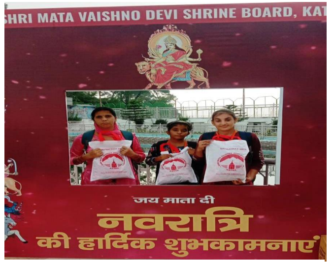
Souvenir items provided to Yatries at selfie point

The CEO interacted with the pilgrims and enquired about the arrangements made by the Board to facilitate them. He expressed satisfaction at the arrangements put in place for the pilgrims at Bhawan and Katra.